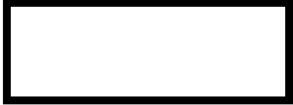
(Signature of the applicant, please fit in the frame)